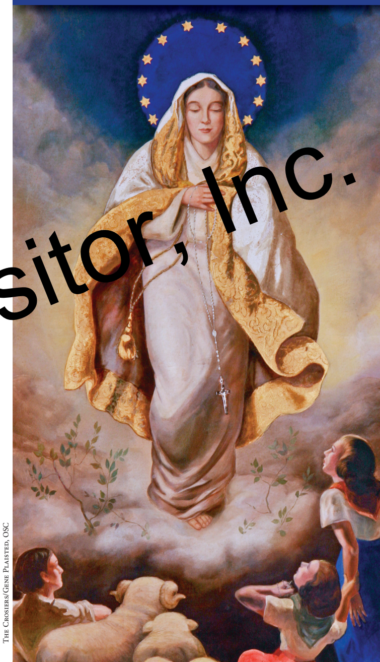
THE CROSSIERS/GENE PLAISTED, OSC